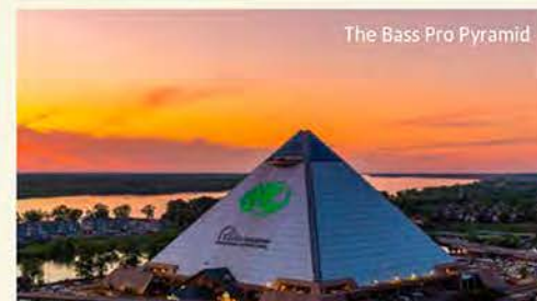
The Bass Pro Pyramid

When not relaxing in the lodge, visitors can